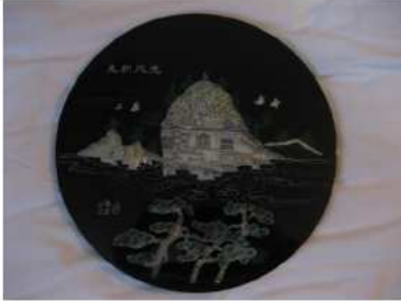
Above: Beautiful lacquer plaque presented by Mayor of Tianshui to Bendigo.