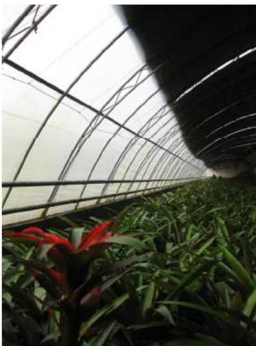
Above: inside view of traditional greenhouses seen all over Gansu province. Facing south with a very thick cement wall which absorbs heat during the day. Approx 100m X 4m.